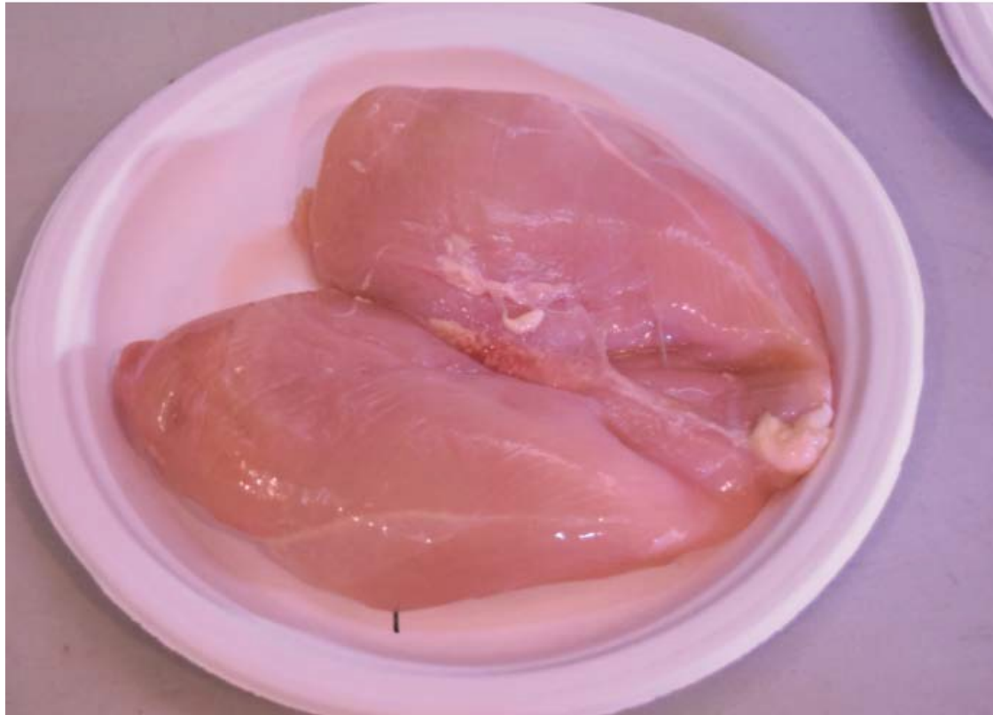
Whole Breast- Chicken