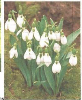
"Snowdrops" Bag of 20 bulbs

Mounds of green foliage support arching dainty chalice shaped flowers. Snowdrops are easy to grow in well drained soil in full sun or partial shade. These bulbs are extremely hardy, and will even bloom during a snowstorm. Plant 5 inches deep and 16 bulbs per square foot. Be sure to water well after planting. They are the first spring flowering bulbs to bloom in the spring garden, and will often grow through a covering of snow. They can show up weeks before Crocuses do. Snowdrops DO NOT like fertilizer and if left undisturbed will naturalize very well, which means they come back year after year and will last a lifetime.