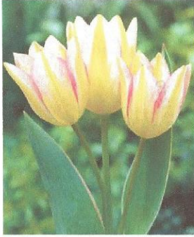
Bunch Tulip "Antoinette"